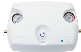
Design protective cover