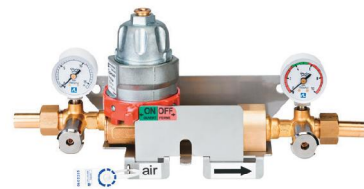
Damao 4 or 8 bar single pressure reducer

2 brazing connectors are included in each reference.