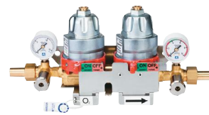
Damao 4 or 8 bar double pressure reducer

Damao double regulator: enhanced safety.