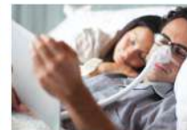
Open field of vision for a feeling of greater independence – patients can read and even wear their glasses

Order online, any time at www.homehealthestore.philips.com