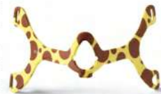
Youth: All three sizes in one package