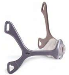
Adult: All three sizes in one package