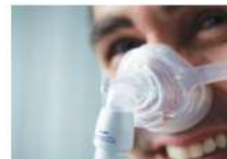
Compact design comfortably fits more than 98% of patients